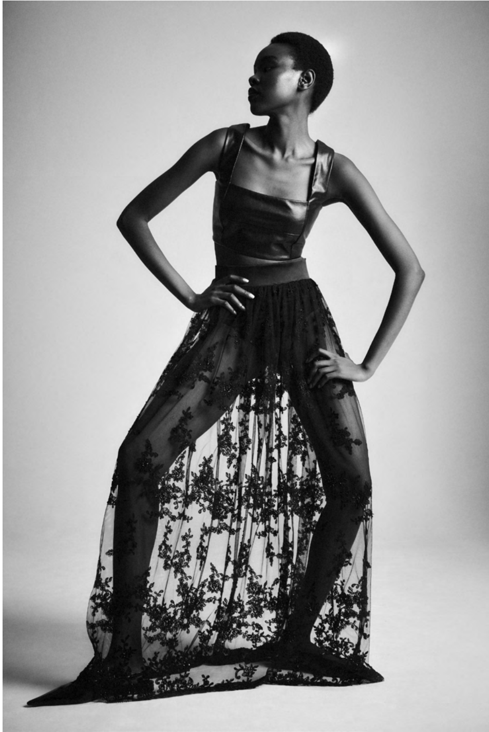
eclipsec look - BLACK LACE SKIRT