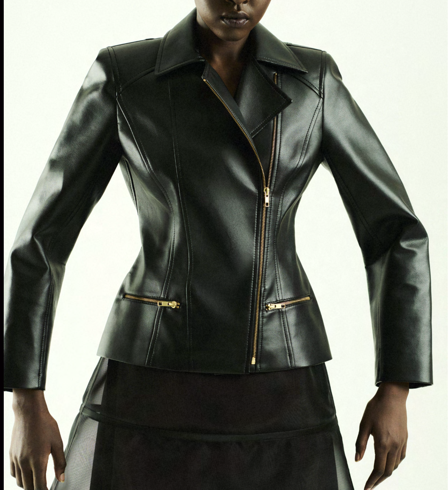
eclipse look - LEATHER JACKET BLACK