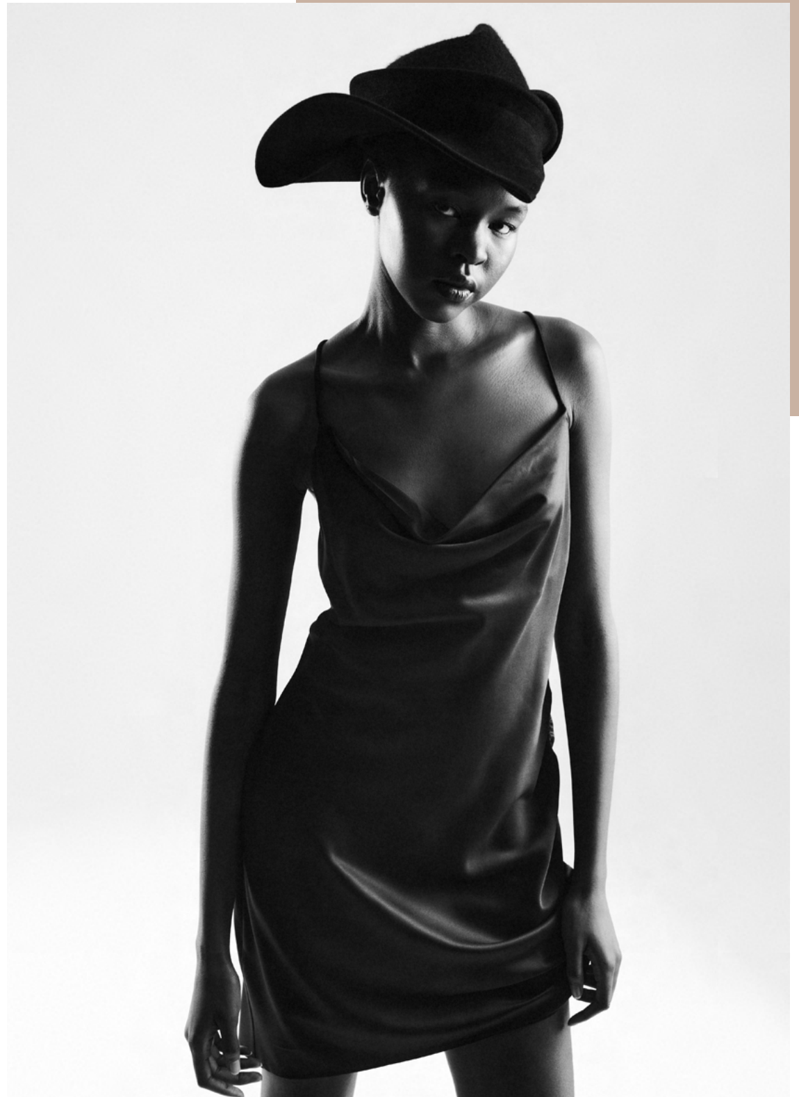
eclipse look - GATHERED SILKY DRESS-BLACK

Each dress is designed with meticulous attention to detail. Draping that flows with purpose, intricate floral patterns that catch the eye of the beholder, and silhouettes sculpted to embrace and accentuate the female form. These creations embody the duality of femininity—the softness of fluidlines balanced by the strength of bold tailoring, reflecting the multifaceted nature of modern women.