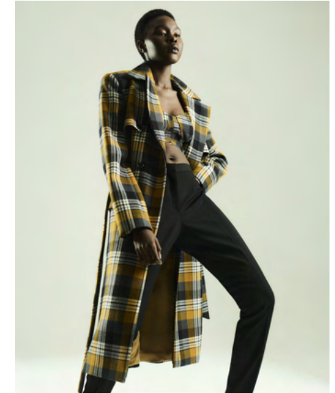
eclipse look - CHECKED TRENCH COAT MULTI