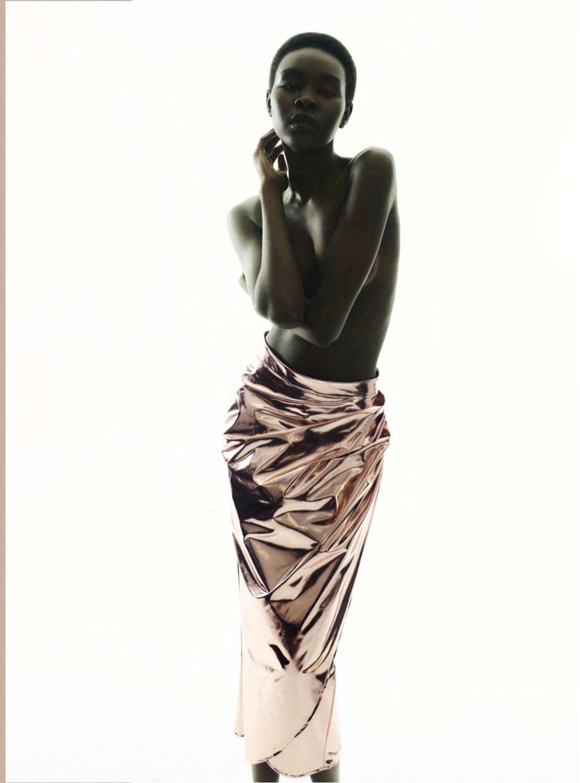
eclipse look - METAL TUBE SKIRT-BRONZE