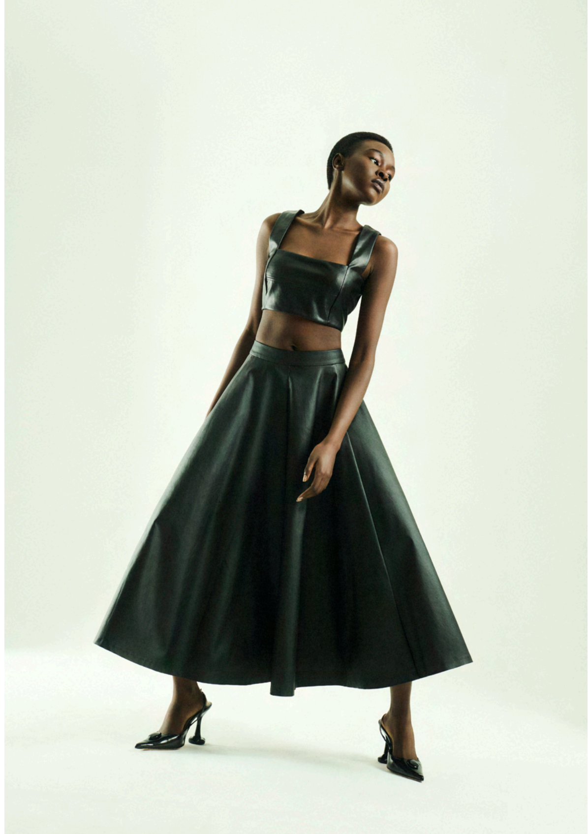
eclipse look - LONG SKIRT BLACK