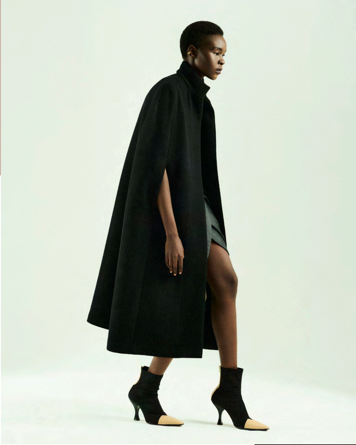
eclipse look - BLACK WOOL CAPE JACKET BLACK