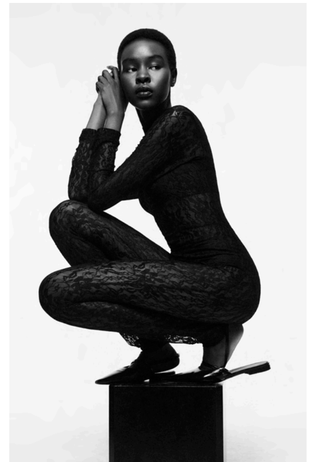
eclipse look - LACE JUMPSUIT

Turn heads with the Moon Florals Lace Catsuit, bold statement piece that embodies avant-garde sophistication. Meticulously designed, it features intricate lacework, long sleeves, a high collar, and an invisible back zipper for a seamless finish. Crafted with stretch fabric, it offers a sleek silhouette and a comfortable fit, ensuring both style and ease of wear.