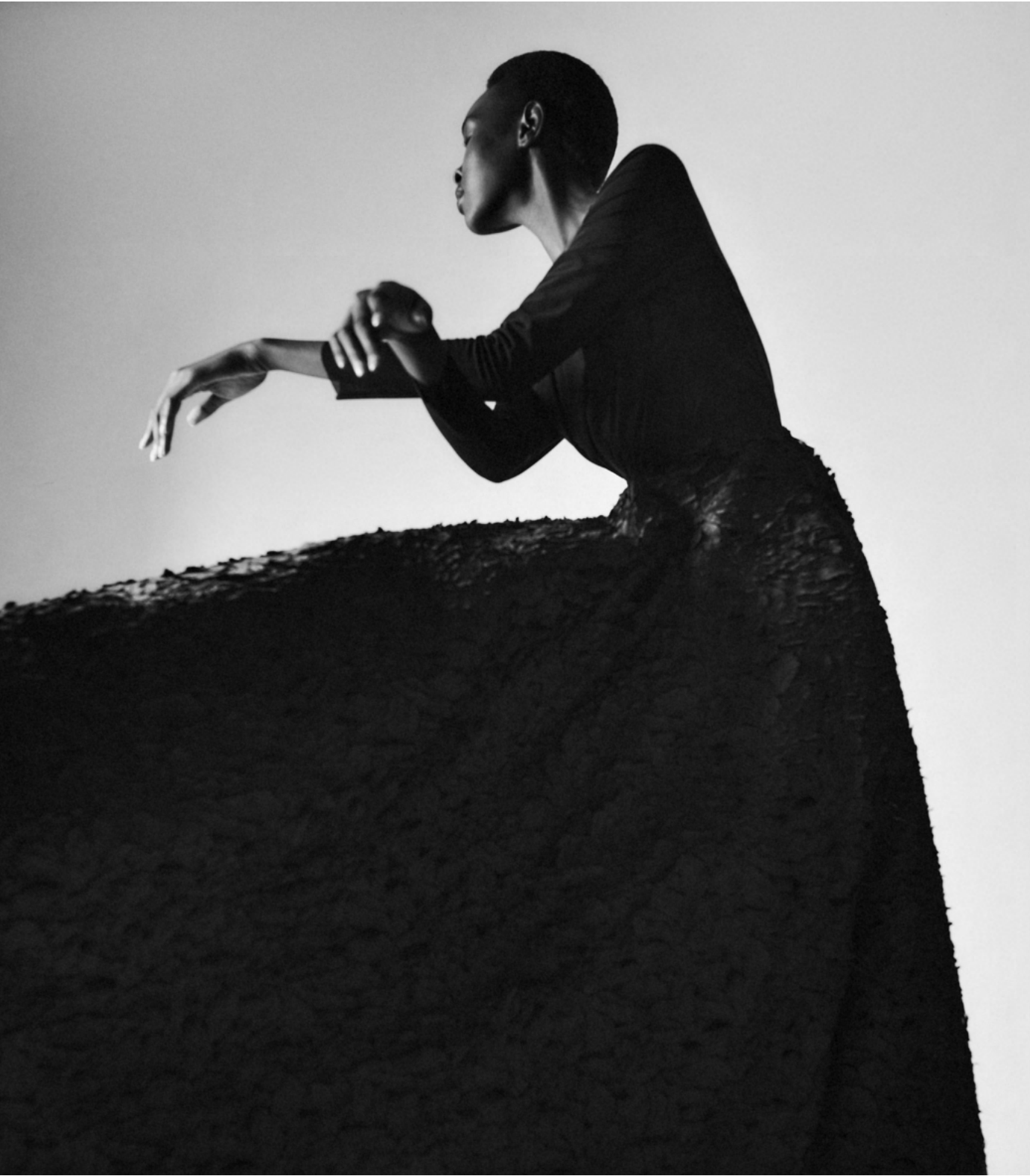
eclipse look - FLOWER DRESS BLACK