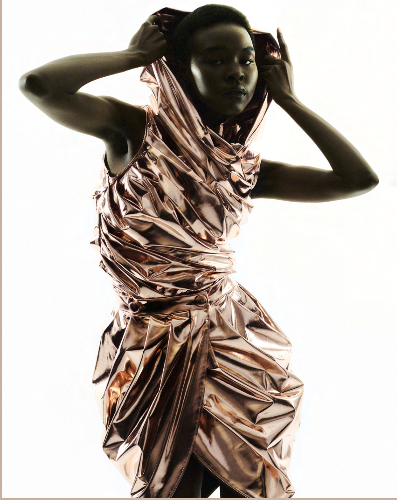
eclipse look - HOODED METALLIC TOP BRONZE